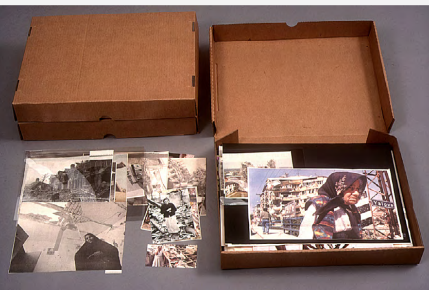
Figure 2. The Collector [1996]. Details of installation: twelve cardboard boxes [each measuring 47 × 34 × 6.5 cm], with newspaper clippings in polystyrene, envelopes and stamped/sorted paper folders; map of the collection and quotations. Pinacoteca do Estado de São Paulo Collection. Box IV, Destruction: Women and Destruction.

Although working abroad, questions that interest me end up relating to Brazilian issues. And pieces that were firstly addressed to a foreign culture, dealing with contents that may seem obvious to a Brazilian public, were revealed to be relevant in Brazil.