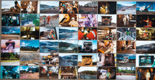
Figure 8. Women in the Mines of All Kinds. Installation view at Kunsthall Aarhus, 2015 at Dump! Multispecies Making and Unmaking, curated by Elaine Gan, Steven Lam and Sarah Lookofsky.

The 'mineiro' 4 chooses not to look at the mountains, adapting to the context without strength or desire to protest against what is the aforementioned vocation. In recent years, this has changed thanks to awakening voices fighting against mining. Militants who, by the way, suffer death threats. Minas Gerais is a rotting land, where destruction is hidden behind curtains of trees planted around huge craters. Pollution is not just visual, industrial violence reaches the groundwater, causes dust storms, consumes water on a large scale to transport, wash and stock ore – and the destruction is not reversed. The local communities do not receive benefits or compensation. I wanted to understand this context and I continue to unfold my work as a means to highlight its issues.