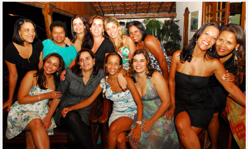
Figure 9. Christmas party of women from the Conceição Mine, Itabira, Minas Gerais. This is the only moment of the year when there are no women in its operation area; they conduct the largest machines of Brazilian industry.

Although the reach of visual arts seems limited, not always reaching a large audience in Brazil, artists make social reality noticeable. Elaborating on ecological issues, criticizing the perpetuation of the colonial mentality that allows the exploitative violence to take place, the artist responds to an urgency. Different questions are at the core of my practice and there is a will to generate debate. As for changes, they are made possible through collective action; it is difficult to assess the 'efficiency' of an artist's work, but I believe in the reverberation of works that bring people together to reflect or to denounce, putting events in historical context, contributing to other practices of other people, artists or not, adding up to other actions and discourses. I believe in a kind of learning and influence network, enabled by artworks or made possible by the practice of teaching.