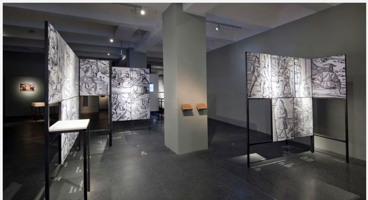
Figure 7. Mineral Invisibility . Installation: 26 posters, 90 x 60 cm each, photographs, video, text by Anselm Jappe, reports from the Ministry of Labour and Employment. Partial view of exhibition World of Matter, HMKV, Dortmund U, Germany, 2014. Curated by Inke Arns.