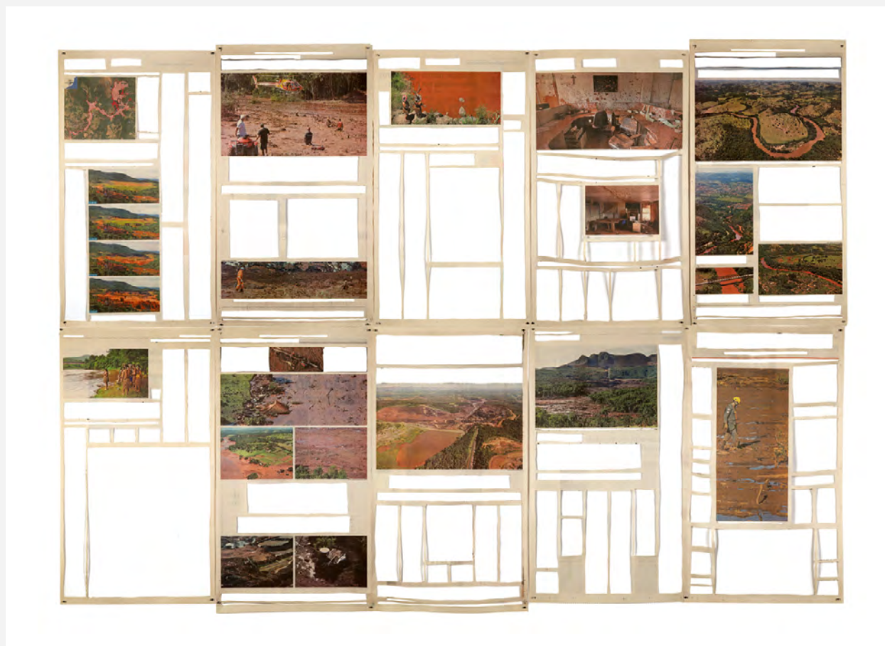
Figure 1. Speaking of Mud , 2019. Details of Part 1, cut newspaper pages reporting the disaster in Brumadinho, happened in 2019.