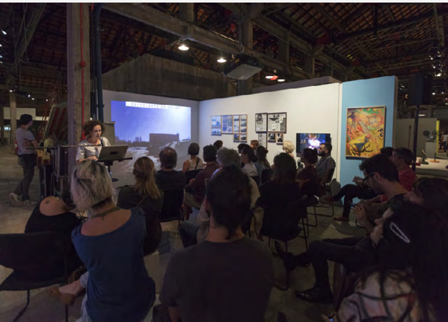
Figure 6. Extraordinary Mineral Stories . Performance at 20 th Videobrasil Festival of Contemporary Art, 2017.

of the images we consume on a large scale and with high speed, but artists work with different temporalities, in layers, articulating meanings beyond appeal and immediate seduction.