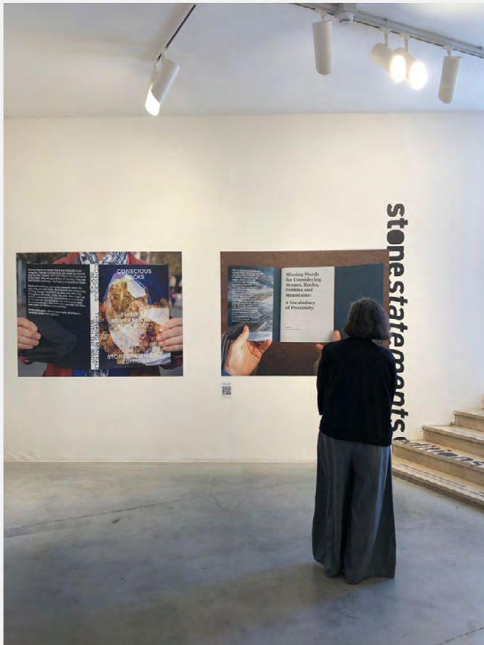
Figure 10. StoneStatements Editions . General view of installation at the 17 th edition of Venice Biennale of Architecture, 2021. Logo: Gisa Bustamante.

This project derives from a relatively straightforward question: “Can an affective connection between people and the elements composing life of a given place generate a sense of protection and care, enough to lead a resistance against its destruction?” And: “Is the mineiro’s critical disengagement from the problems caused by mining (an industry that drains life and compromises the future of the next generations) not due to the loss of a deep and complex relationship with the place?”.